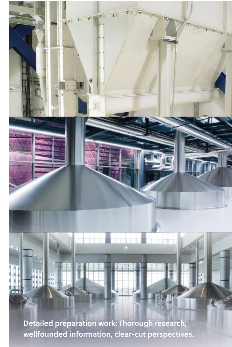
Detailed preparation work: Thorough research, wellfounded information, clear-cut perspectives.

The first step to a turnkey brewery: What is feasible? With our feasibility study we reveal all options within the scope of your specified requirements: beer types, recipes, volumes, engineering, product design in the Ziemann Holvrieka Technology Center , marketing consultation services.