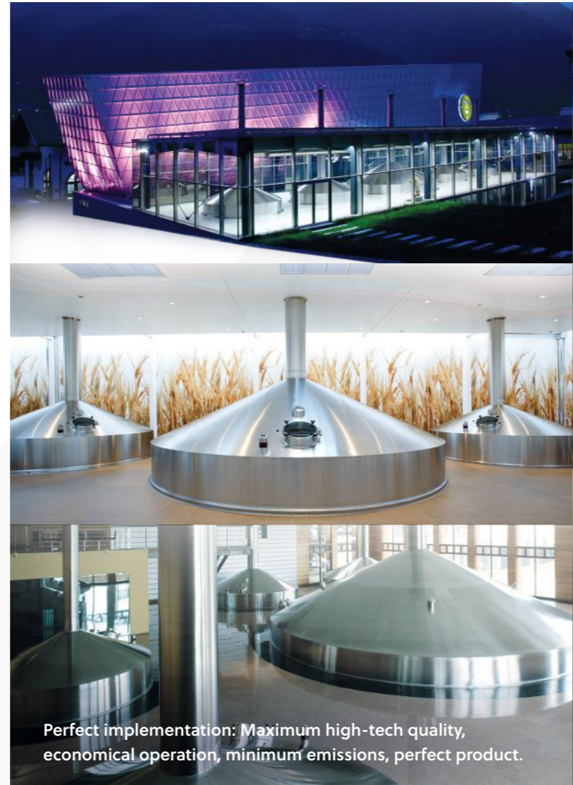
Perfect implementation: Maximum high-tech quality, economical operation, minimum emissions, perfect product.

The fourth step to a turnkey brewery: implementation within cost and schedule estimate. With all technical and technological innovations including automation. Accomplishment of all guaranteed values. Training of personnel on the spot or at the Ziemann Holvrieka Technology Center . Start-up and handing over of the plant. Technical and technological service.